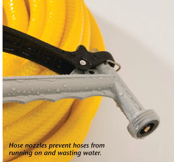
Hose nozzles prevent hoses from running on and wasting water.