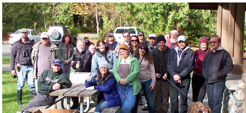
Watershed Masters 2010

Special thanks to all of our partnering organizations who made the Skagit Conservation District's efforts toward conservation, water quality improvement, and best land-management practices a huge success yet another year!!