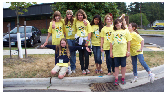
Storm drain marking group