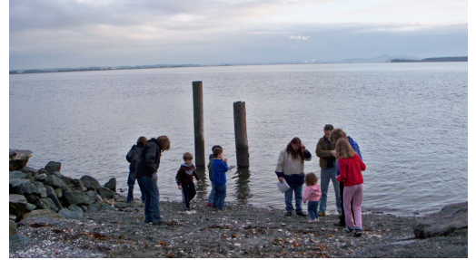
Family Night at Samish Bay workshop