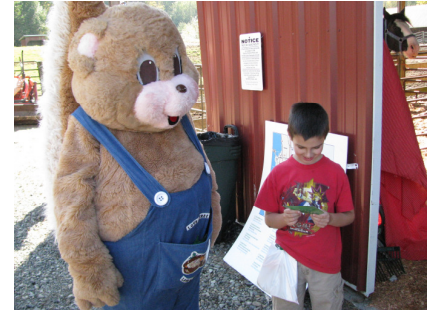
Sprig the Treeture at the Festival of Family Farms