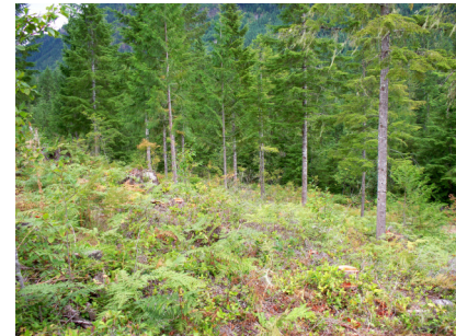
Thinned stand under EQIP