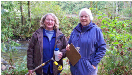
Skagit Stream Team