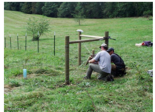
CREP fence being installed