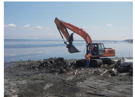
Removal of rock groin at March's Point