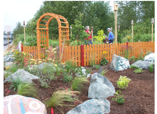
Kulshan bird & butterfly garden