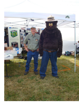
Firewise outreach with Smokey Bear