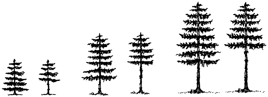
Figure 2. As the tree grows, each successive lift removes the branches below the 50 percent crown level. From Emmingham and Fitzgerald, EC 1457, Pruning to Enhance Tree and Stand Value, courtesy of Oregon State University Extension Service.

bole to be pruned should be about 4–5 inches at the time of each lift (Figure 2). General guidelines for westside Douglas-fir follow: